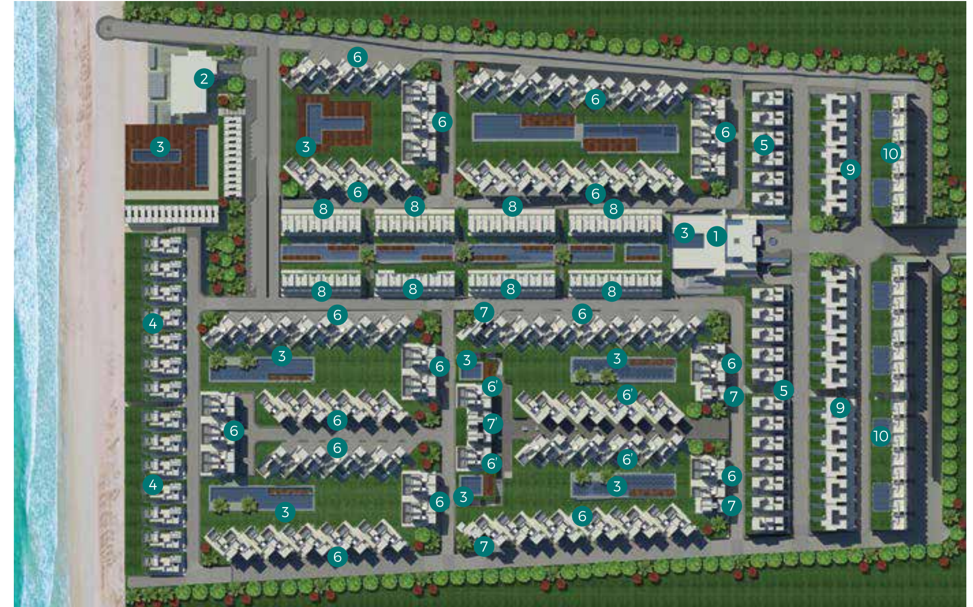
This Masterplan is an artist impression, actual product may vary.